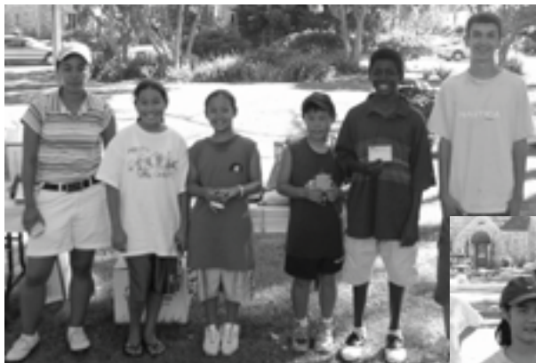
Longest Drive Winners