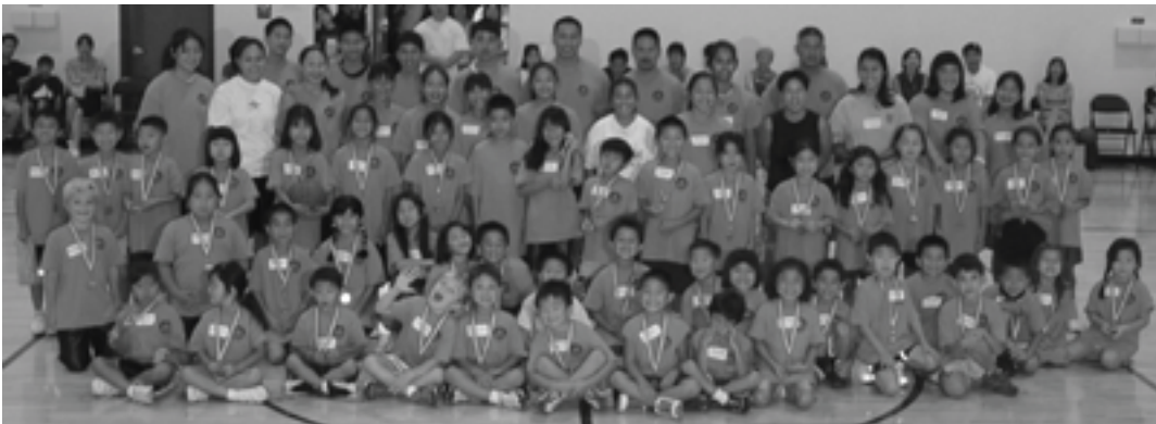
Kindergarten and first grade Basic Hoops participants.