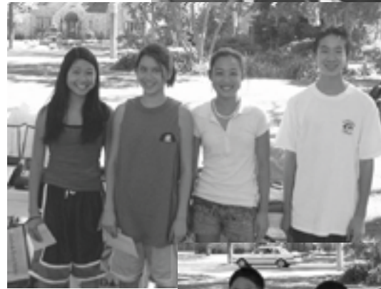
2nd Flight Winners