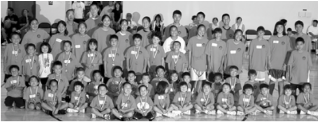
Second and third grade Basic Hoops participants.