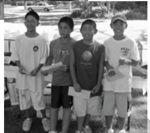
3rd Flight Winners